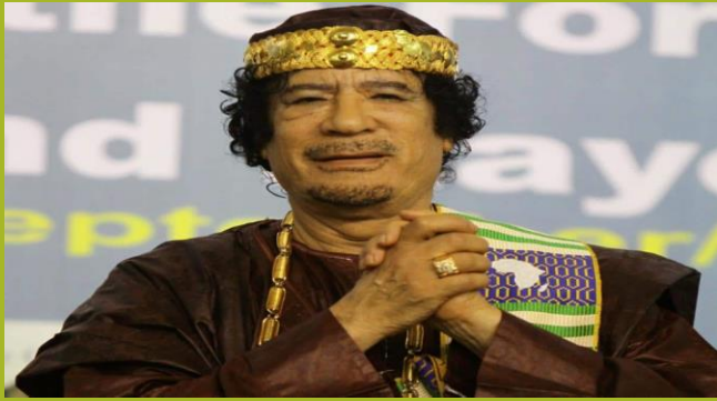
Muammar Mohammed Abu Minyar Gaddafi , commonly known as Colonel Gaddafi, was a Libyan revolutionary, politician and political theorist. Born: 7 June 1942 Assassinated: 20 October 2011 Net worth: US$200 billion (2011, est.)