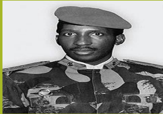
Thomas Isidore Noël Sankara was a Burkinabé militant social justice campaigner and President of Burkina Faso from 1983 to 1987. He was viewed by supporters as a charismatic and iconic figure of revolution Born: 21/12/1949, Assassinated: 15 /10/1987