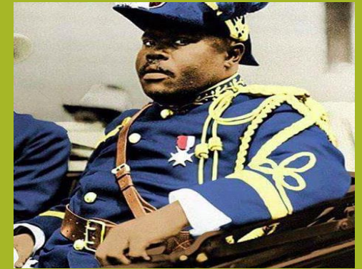
Marcus Garvey was a Jamaican-born black nationalist and leader of the Pan-Africanism movement, which sought to unify and connect people of African descent worldwide with a Plan of returning to Africa. Born: 17 August 1887, Died: 10 June 1940